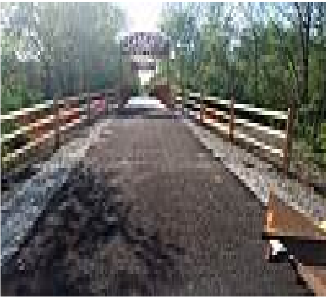
Nickel Plate Trail.

Completed in late 2015, the Converse Junction Trail provides 2 miles of smooth asphalt along a former Penn Central railroad line,