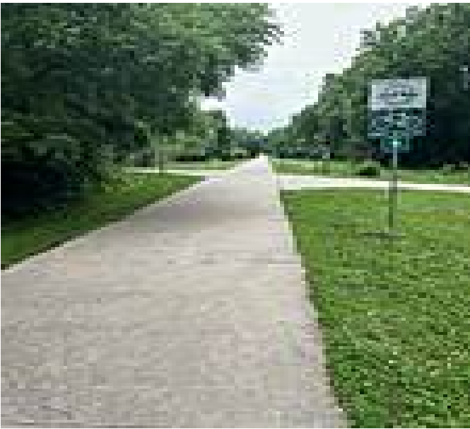
Lawrence Loop around the city.

The Burroughs Creek Trail and Linear Park runs from 11th to 23rd streets along an abandoned rail corridor just west of Haskell