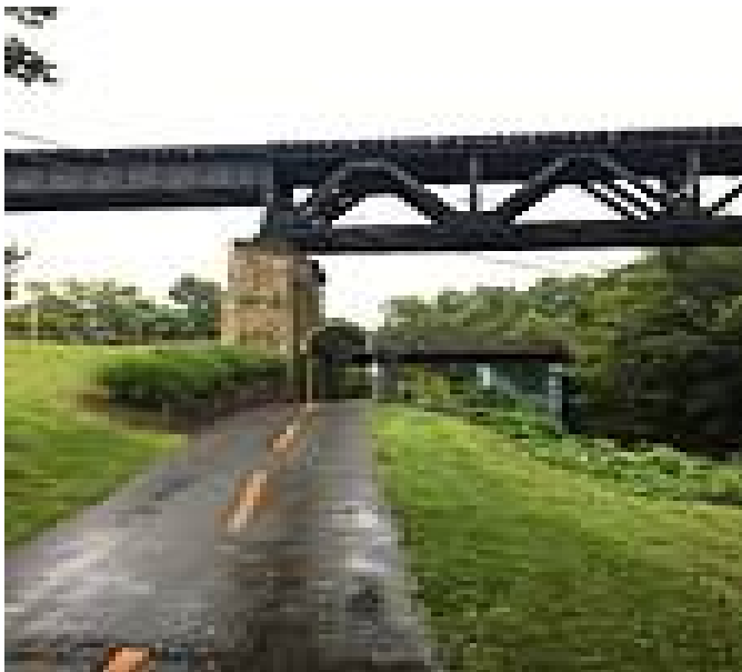
Luray from the greenway.

The Hawksbill Greenway is a 2-mile non-motorized pathway in the town of Luray, Virginia, two hours from Washington D.C. It extends